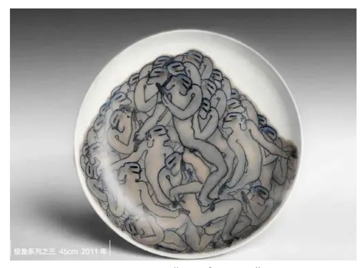
Figure 2. "Awakening"

In the current market, the kinds of ceramics of daily use products are very rich, and the daily use products of symbolic nature have begun to open up gradually. Many ceramic designs add metaphors to make the design have deeper social significance. For example, Liu Zheng's Awakening of Insects (see Fig.2). Plate is a ceramic product of daily use. The female symbol is painted on it to make it have its connotation and the depth of the author's thought.